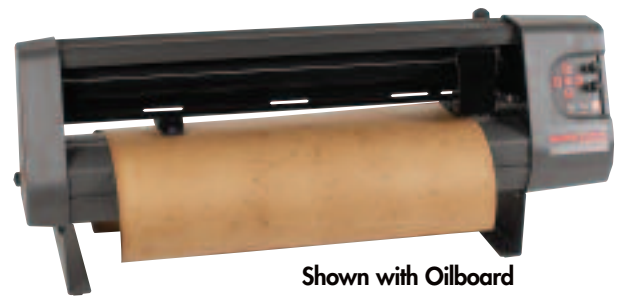
Shown with Oilboard

Over 48 Stencil, Military Fonts, and 19 International Caution Marking Symbols come standard in software.