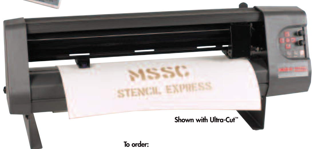
Shown with Ultra-Cut™