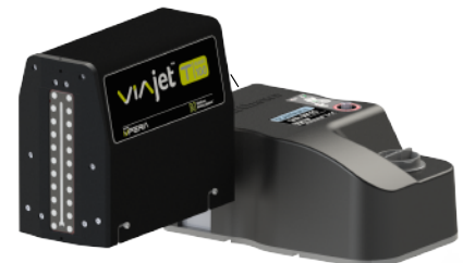
VIAjet™ T-Series T100 Print Head